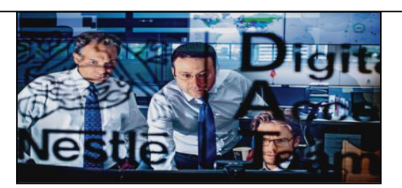
Digital, IT & Technology